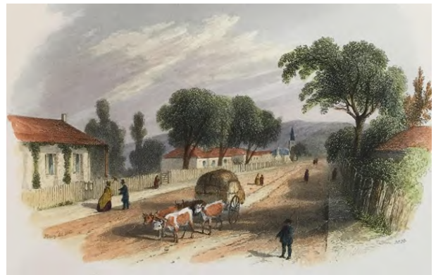
RICHMOND Looking West 1854 by FC Terry

Australian Christmas Bush Ceratopetalum gummiferum