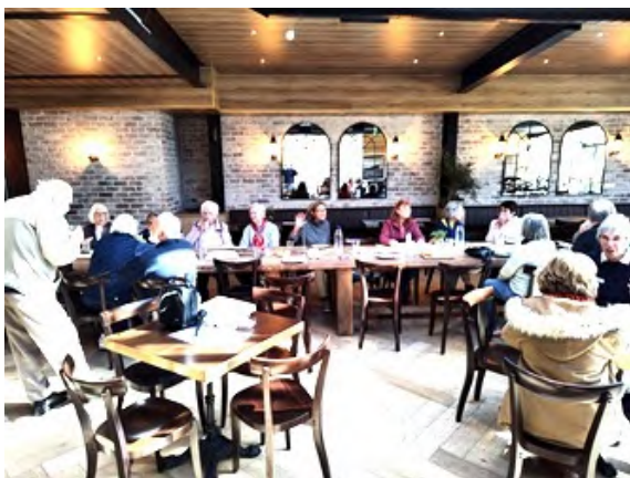
Image 1 Morning Tea Inside the recently renovated Royal Hotel Richmond. Image 2 North Richmond Hotel verandah. The original hotel opened in 1833 as The Woolpack Inn, demolished in the 1960s. The current hotel was built in 1933 and the front façade covered in 1970. It is currently being restored to its 1933 appearance. Image 3 Cedar Staircase - Historic Macquarie Arms Hotel Thompson Square, Windsor