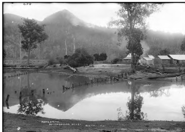
Homestead Burragorang Valley

'A pity yes, but Sydney has now a population of close on two million people...Their need of water is all-important. The sunken valley, of lush green fields, rock-strewn fords, clear white gums and red cattle, tomato farms and pumpkin farms would all disappear along with the valley's 700 inhabitants living below the predicted water line, along with tiny schools, village halls and churches.' [31 August 1953] Cont. page 5