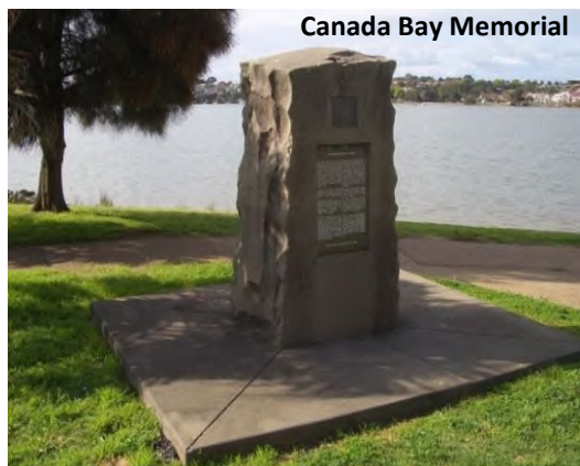
Canada Bay Memorial