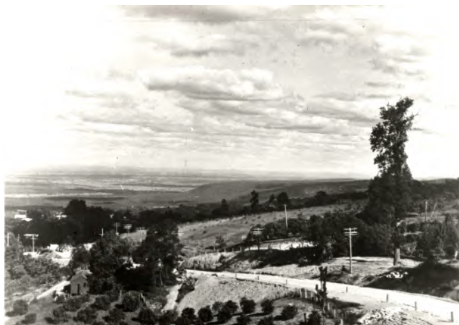
View from Northfield looking South East over the Hawkesbury - Nepean River Flood Plain.