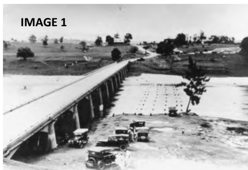
Image 1 The North Richmond Bridge C1920s - Bells Line of Road looking towards North Richmond. The piers supporting the original 1860 bridge can be seen. On the rise to the left of the road is the old North Richmond Travellers Rest Inn, in the 1930's known as Riverview.