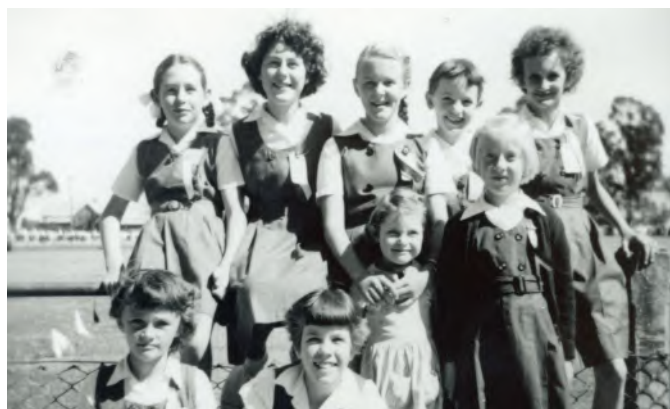
Grose Wold pupils at the Small Schools Sports Carnival in 1959

I do remember that quite a few lessons were conducted outside - particularly the learning of our "times tables" by rote. That lesson was always held under the Camphor Laurel tree that stood at the front of the building. We always sat outside in the playground for our sewing and knitting classes too, while the boys were taught woodwork in the shed at the back. We also all had gardens to care for, flower gardens for the girls and vegetables for the boys. As a farmer's daughter, I always thought it very unfair that I was not allowed to grow vegetables, but had to care for the sparse flower garden with poor soil under a large tree.