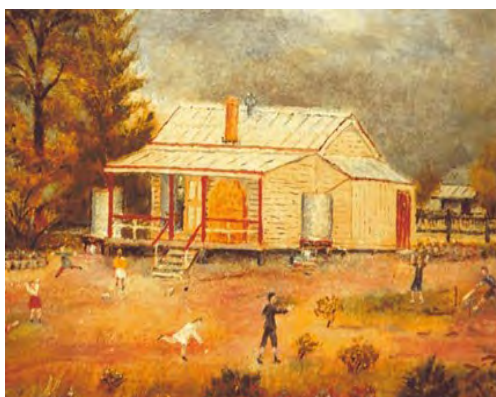
School House Painting 1946 by Mr Moore

The School was closed permanently in 1977 by the Department of Education due to the necessity to install a septic system (pit toilets were still in use) and the funds were not available to upgrade to a septic system. Students from Blaxland Ridge were sent to Comleroy Road Public School when the school was closed, leaving only cherished memories of school days at the little country school at Blaxland Ridge.