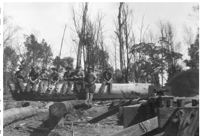
TIMBER WORKERS early C1920s at Hobby's sawmill, Bells Line of Road, in the vicinity of the present day Kurrajong Heights Bowling and Recreation Club - Image 034914 KCHS Archives - Photo courtesy Noreen Montgomery

Please contact: President Steve Rawling Mob: 0414 567 795 casrawling@bigpond.com