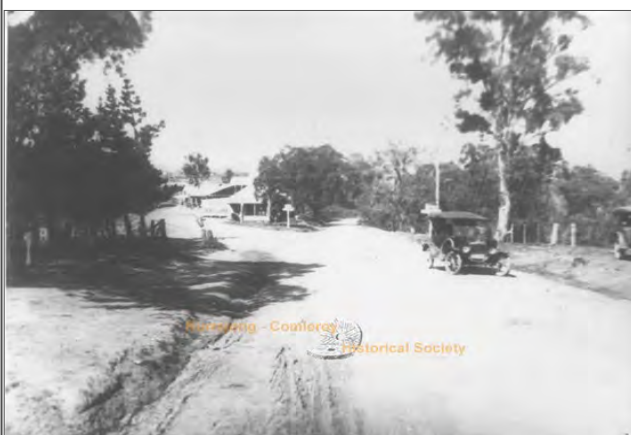
Image: Bells Line of Road through Kurrajong Village prior to the DMR Bypass completed in 1947

Summary for the May KCHS GM - Information obtained from the RTA/RMS by Suzanne Smith 2012