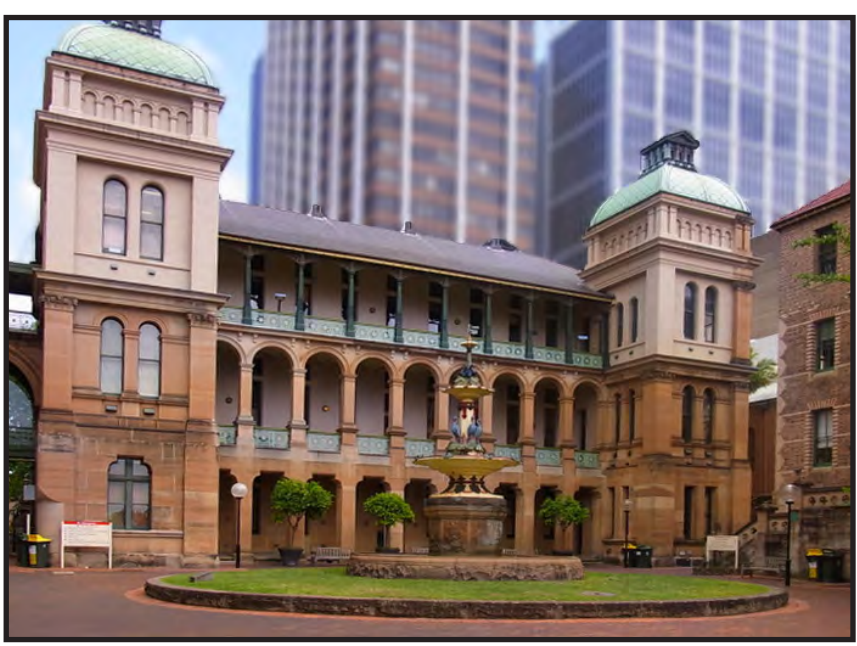
Sydney Hospital's north wing and fountain. The Nightingale wing is to the right.