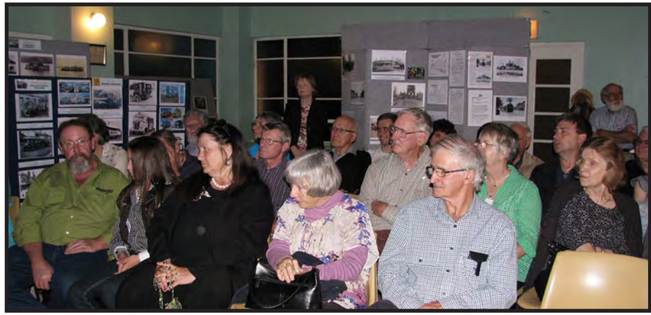
Some of the approximately fifty people who attended the Friday night opening at the CWA hall

Thanks also to the many members who took time to do a turn on the roster over a long but satisfying weekend.