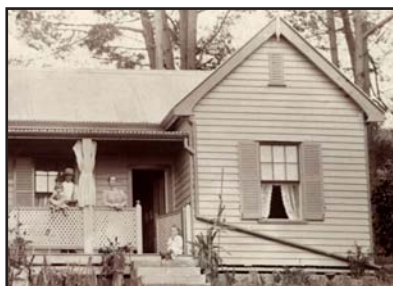
Front verandah circa 1902