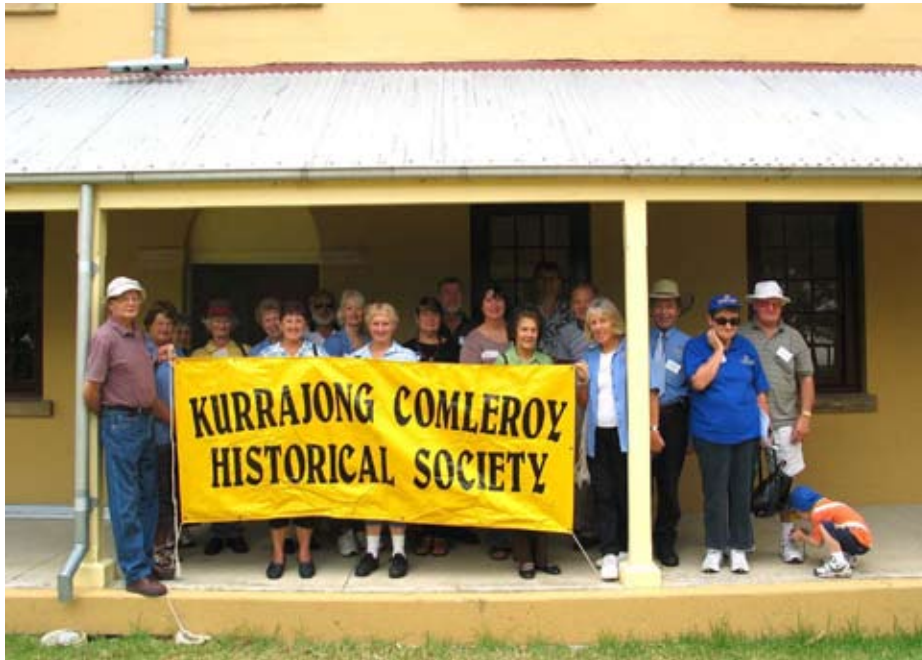
KCHS members on the Grain Road trip outside the historic schoolhouse / chapel at Wilberforce.

Les had a copy of this old 1833 parchment map on display for the Grain Road Trip. The river was painted in blue, showing all the wharves, ferries and fords accessible from the Grain Road. The owners of early properties that the Grain Road passed through included (starting at the Kurrajong end) Rouse, Baldwin, Gosport, Raby, Cobcroft, Lock, Robinson, Malony, Dargon, Howarth, Dunstan and Atkins. The map showed several deviations, with the road then in use marked in colour.